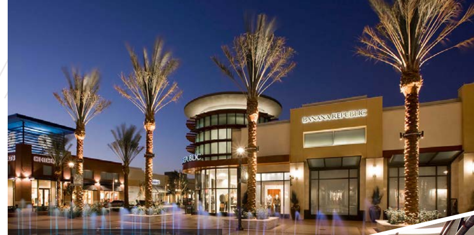
Chino Spectrum Town Center