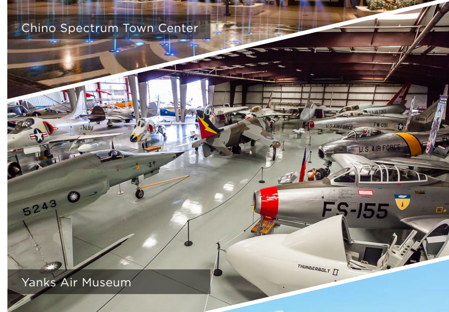
Yanks Air Museum