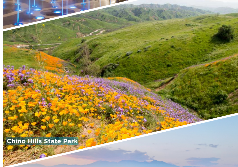
Chino Hills State Park