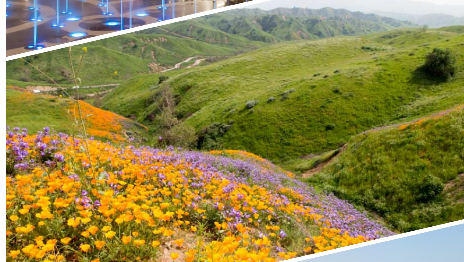
Chino Hills State Park