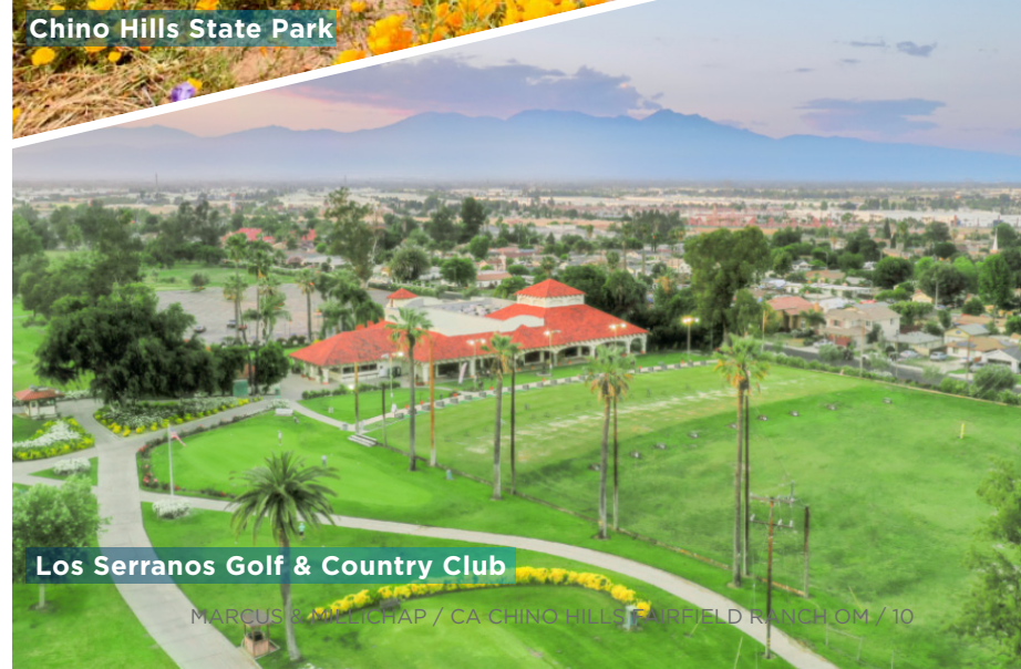
Los Serranos Golf & Country Club