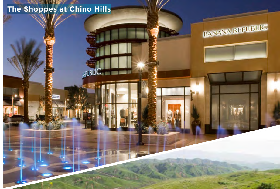
The Shoppes at Chino Hills