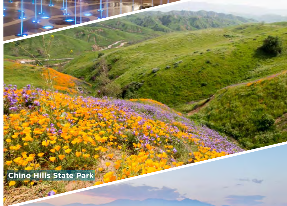
Chino Hills State Park