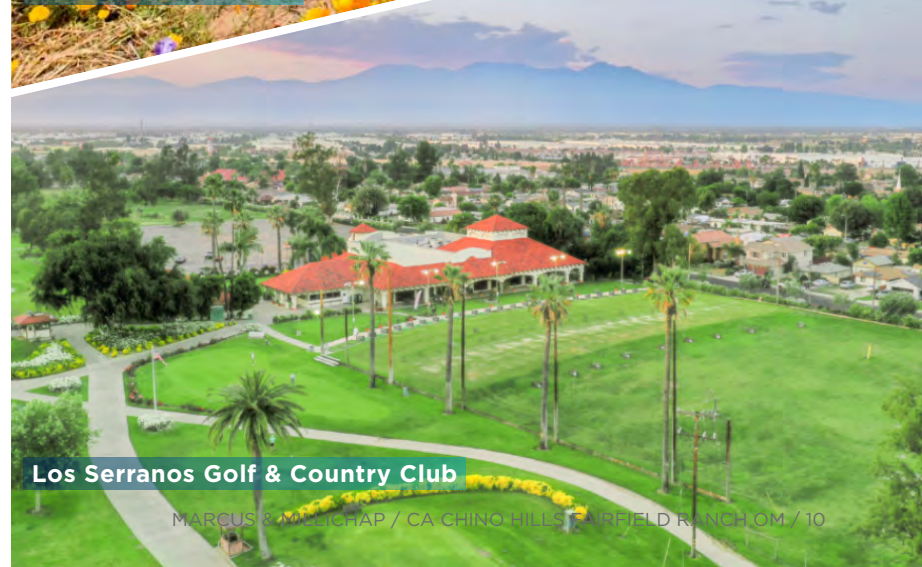
Los Serranos Golf & Country Club