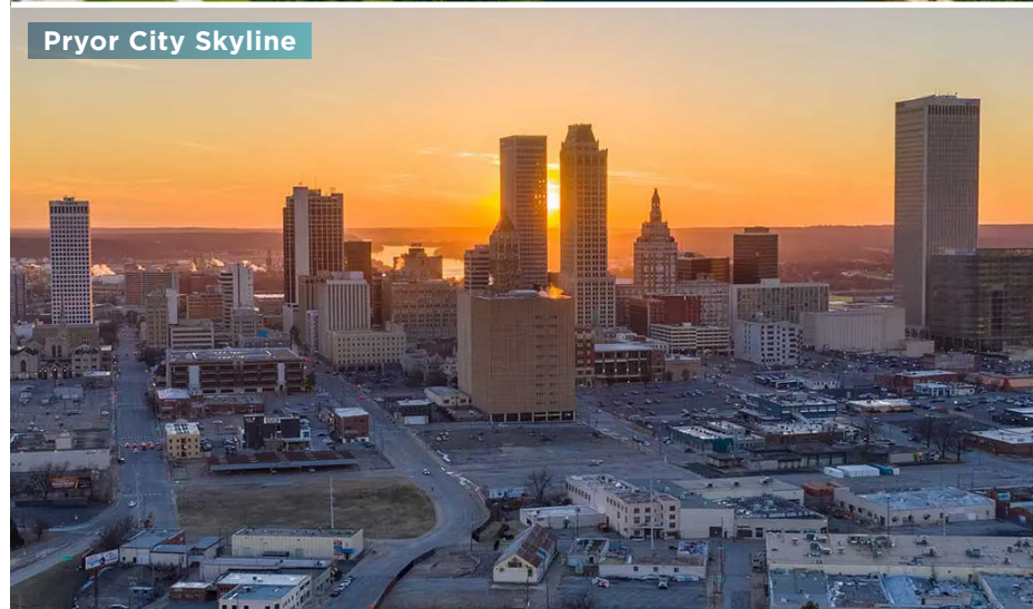
Pryor City Skyline