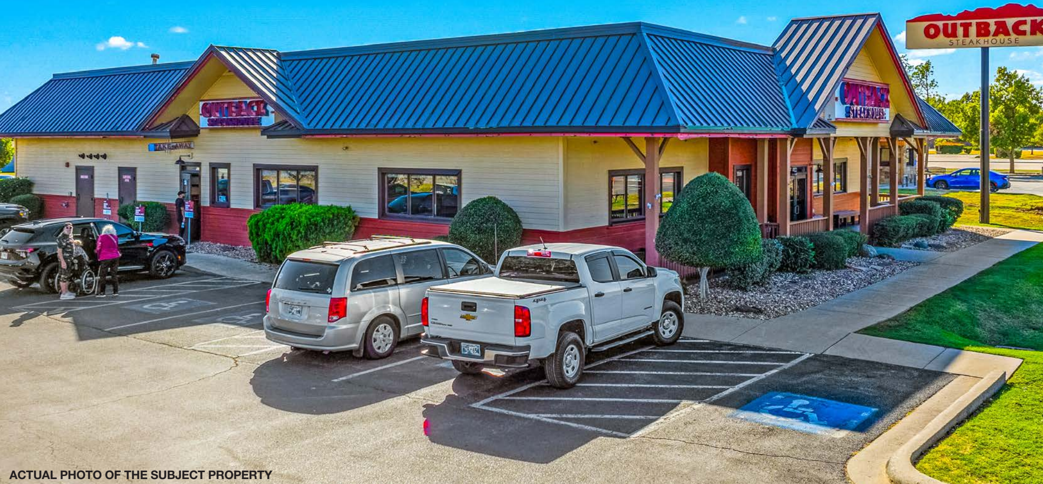
ACTUAL PHOTO OF THE SUBJECT PROPERTY

Marcus & Millichap DUONG INVESTMENT GROUP