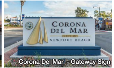
Corona Del Mar - Gateway Sign