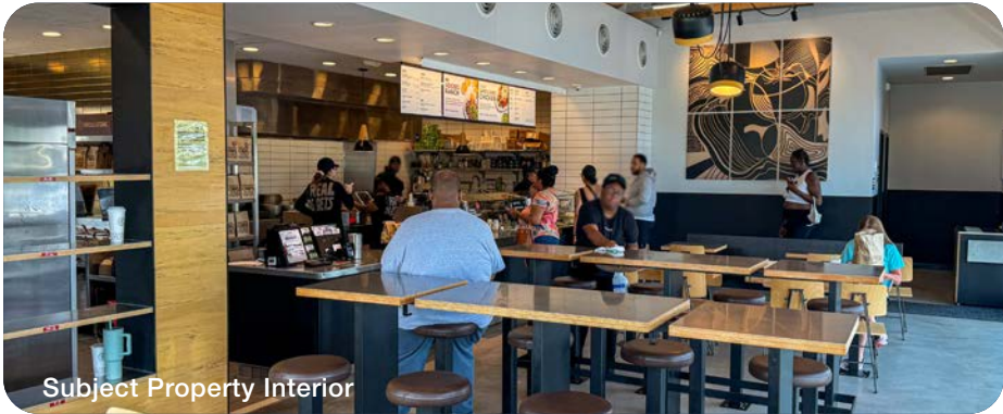
Subject Property Interior