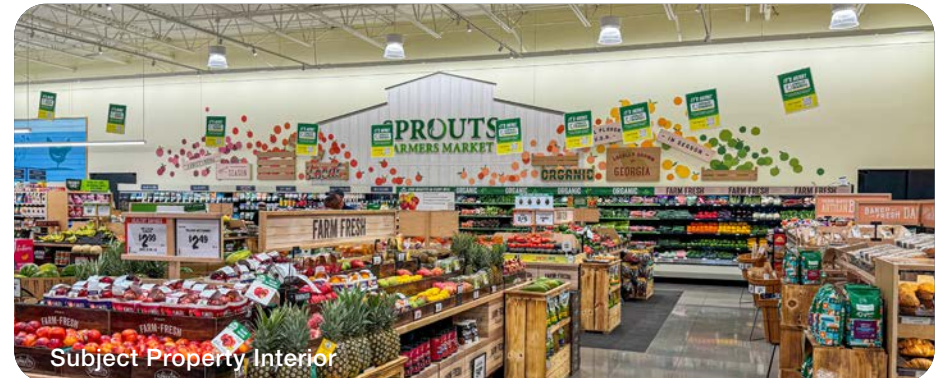
Subject Property Interior

“The new Sprout’s Farmer Market is just what we needed...the Rotisserie Chicken, Macaroni & Cheese, and potato salad are the best around. I look forward to going back again and again each week.” -Elton A., Yelper