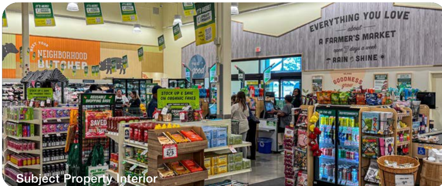
Subject Property Interior