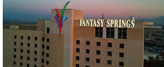
Fantasy Springs Resort Casino

The Coachella Valley is also one of North America's premier golf destinations with more than 100 courses attracting seasonal visitors and high-income households throughout the winter and spring months. Notable championship destinations include PGA West in nearby La Quinta, host of the annual American Express PGA TOUR tournament, along with Indian Wells Golf Resort and SilverRock Resort. Positioned along Interstate 10, the primary east-west corridor connecting the Coachella Valley to the Inland Empire and greater Southern California, the subject location benefits from strong regional accessibility and placement within one of the valley's primary retail corridors serving the growing eastern Coachella Valley trade area.