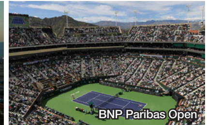
BNP Paribas Open