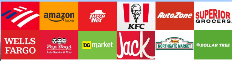
MAIN STREET RETAILERS