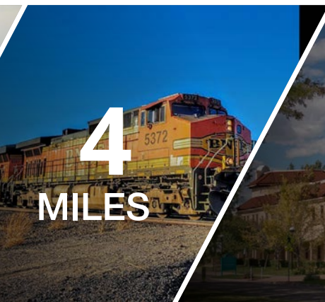
Pueblo Community College